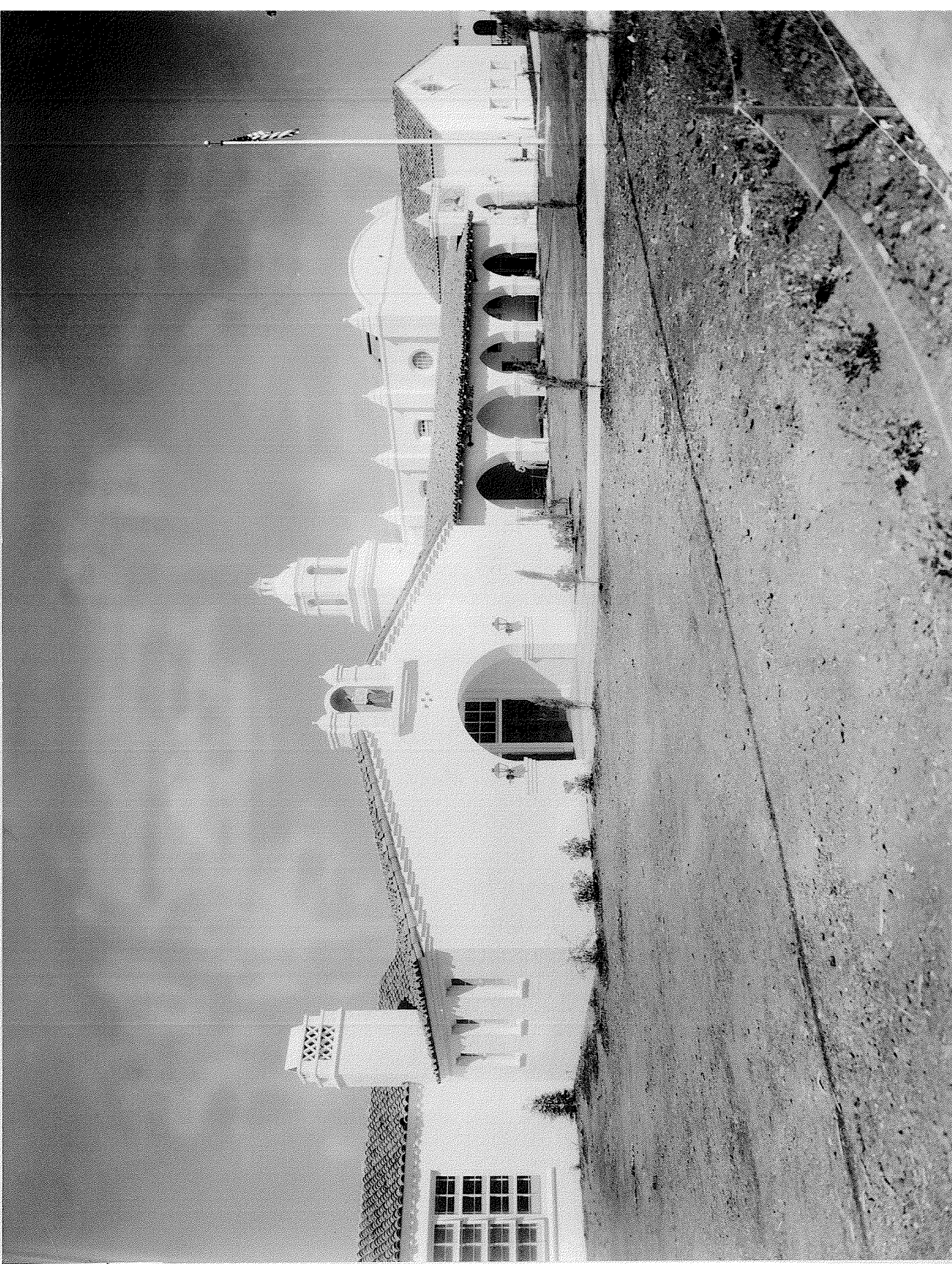
[on back: Vallejo Junior High School]

THE AMERICAN INSTITUTE OF ARCHITECTS ARCHIVES For information or study purposes only. Not to be recycled, quoted, or published without written permission from the AIA Archives, 1735 New York Ave. NW, Washington, DC 20006