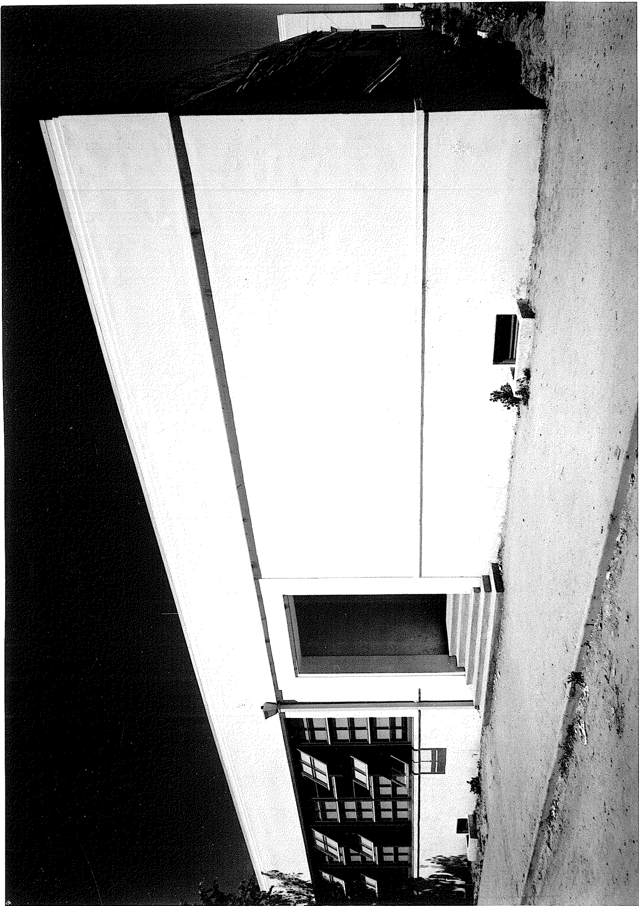
[on back: Brentwood Deer Valley Grammar School, Brentwood, Calif.]