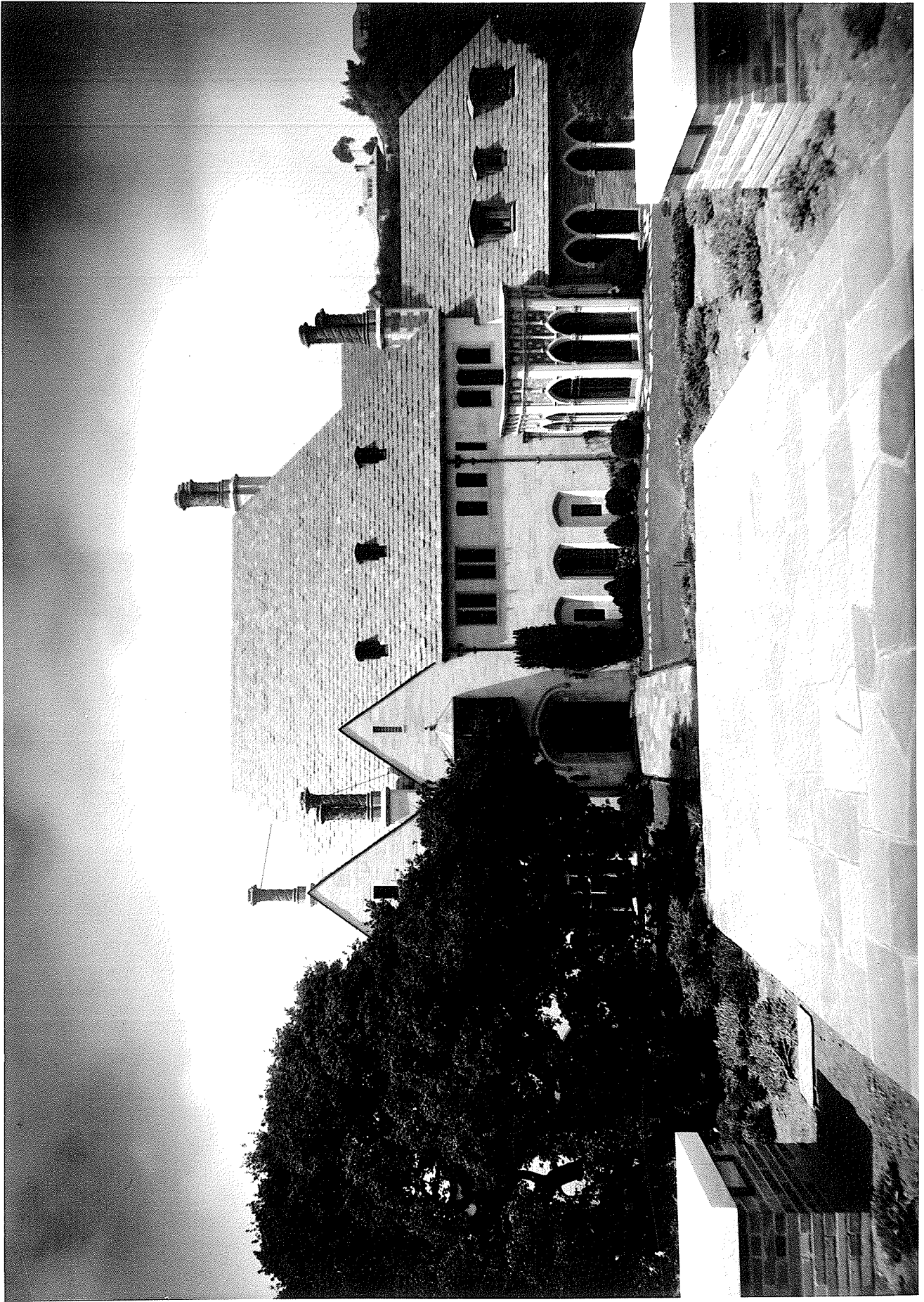
[on back: Sweetland]