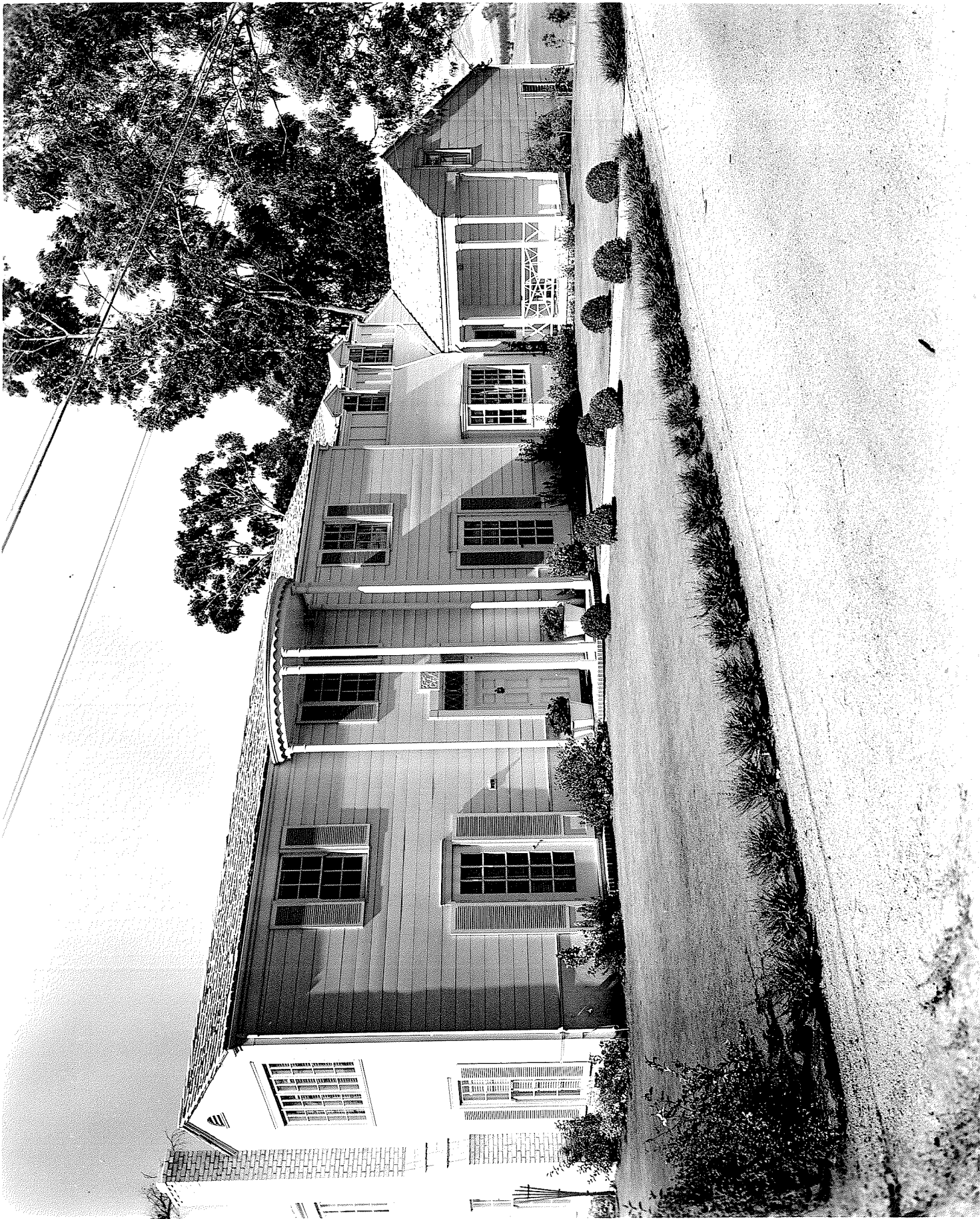
[on back: Ohara House]

THE AMERICAN INSTITUTE OF ARCHITECTS ARCHIVES For information or study purposes only. Not to be recycled, quoted, or published without written permission from the AIA Archives, 1735 New York Ave. NW, Washington, DC 20006