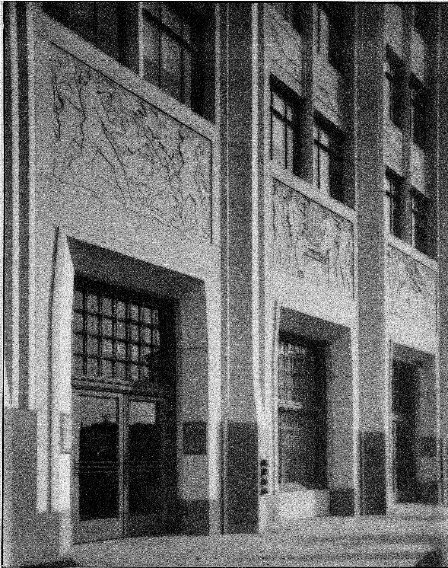
[on back: Security Office Bldg., Oakland, Calif.]

THE AMERICAN INSTITUTE OF ARCHITECTS ARCHIVES For information or study purposes only. Not to be recycled, quoted, or published without written permission from the AIA Archives, 1735 New York Ave. NW, Washington, DC 20006