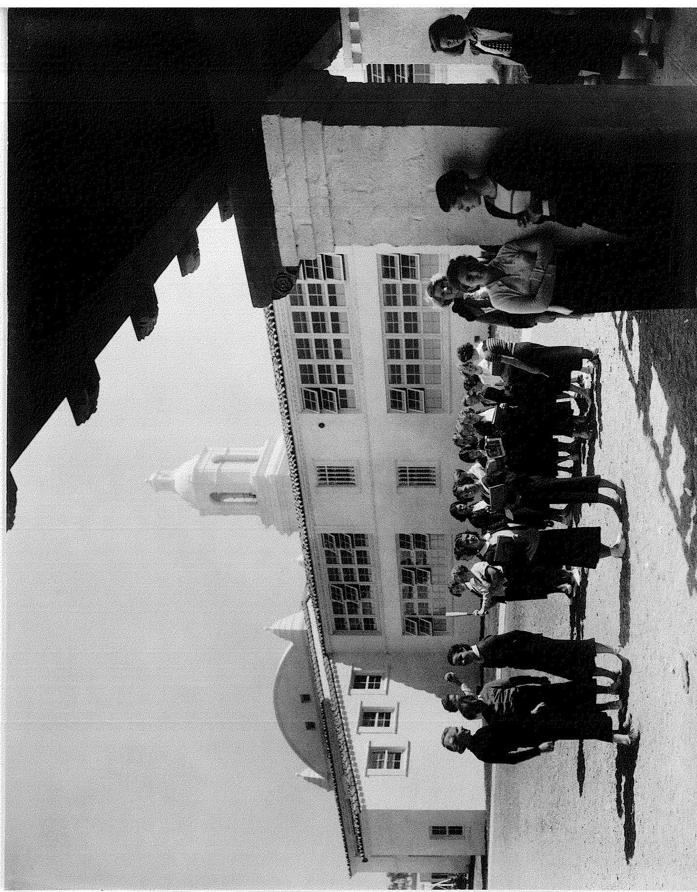
[on back: Vallejo Junior High School]

THE AMERICAN INSTITUTE OF ARCHITECTS ARCHIVES For information or study purposes only. Not to be recycled, quoted, or published without written permission from the AIA Archives, 1735 New York Ave. NW, Washington, DC 20006