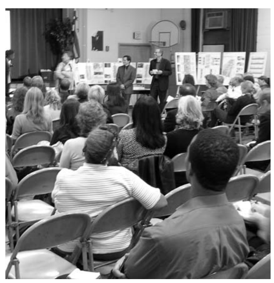
Pro bono projects often focus on clarifying the goals of a community as gleaned from a consensus of residents.

Pro bono services are defined as services of a professional nature that are typically provided by a registered/licensed architect, members of an architectural firm (including interns), AIA components, colleges and/or community-design centers but for which those individuals or entities involved receive no financial compensation.