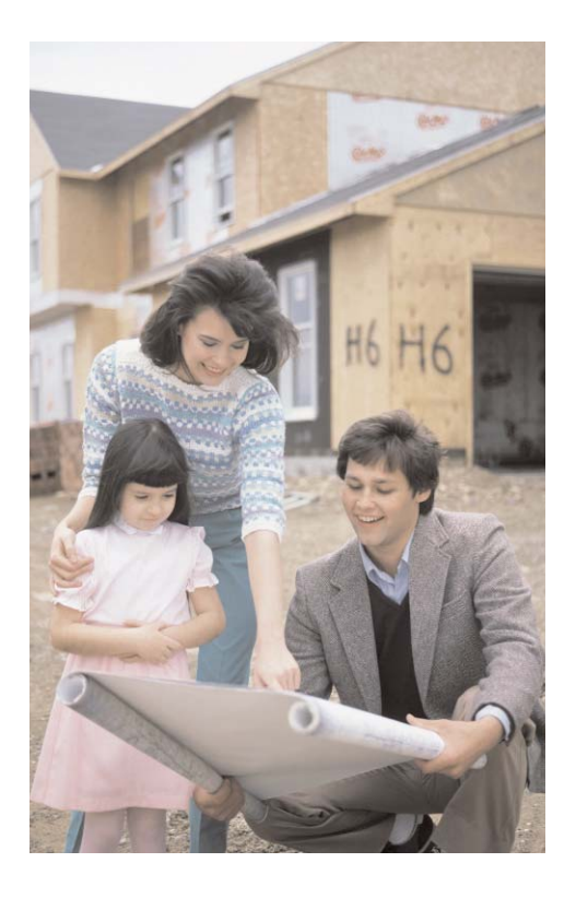
Many universities have extensive experience in operating service-learning/community-assistance studios.

5.2. FACULTY MEMBER ENGAGEMENT: Over the years, tenured or adjunct faculty members—both AIA members and non-members—have participated in providing pro bono or reduced fee services as through in-situ planning, urban design, and design-build. Going forward, involvement by AIA architects as teachers/practitioners may be one of the best ways to help narrow the gap between the theory learned in the academy and the practice of architecture in the field. A real opportunity exists for AIA architects to be seen by students as role models who are committed as educators/practitioners to serve society in ways not traditionally associated with private-sector practitioners. This is an additional opportunity to engage architects who have chosen to practice in the public and not-for-profit sectors, thus exposing students to another exciting and rewarding career path.