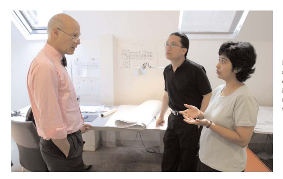
Engagement in pro bono activities allows architects of any age and experience level to contribute, and in many cases, to have meaningful interaction as part of their respective involvements.