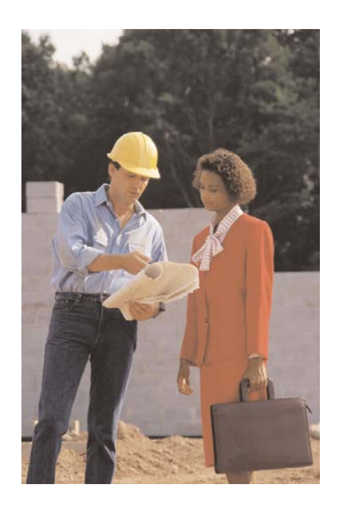
Many AIA members partnered with allied professionals to provide significant pro bono services.

The AIA has a long history of providing services to communities to assist them in their revitalization efforts.