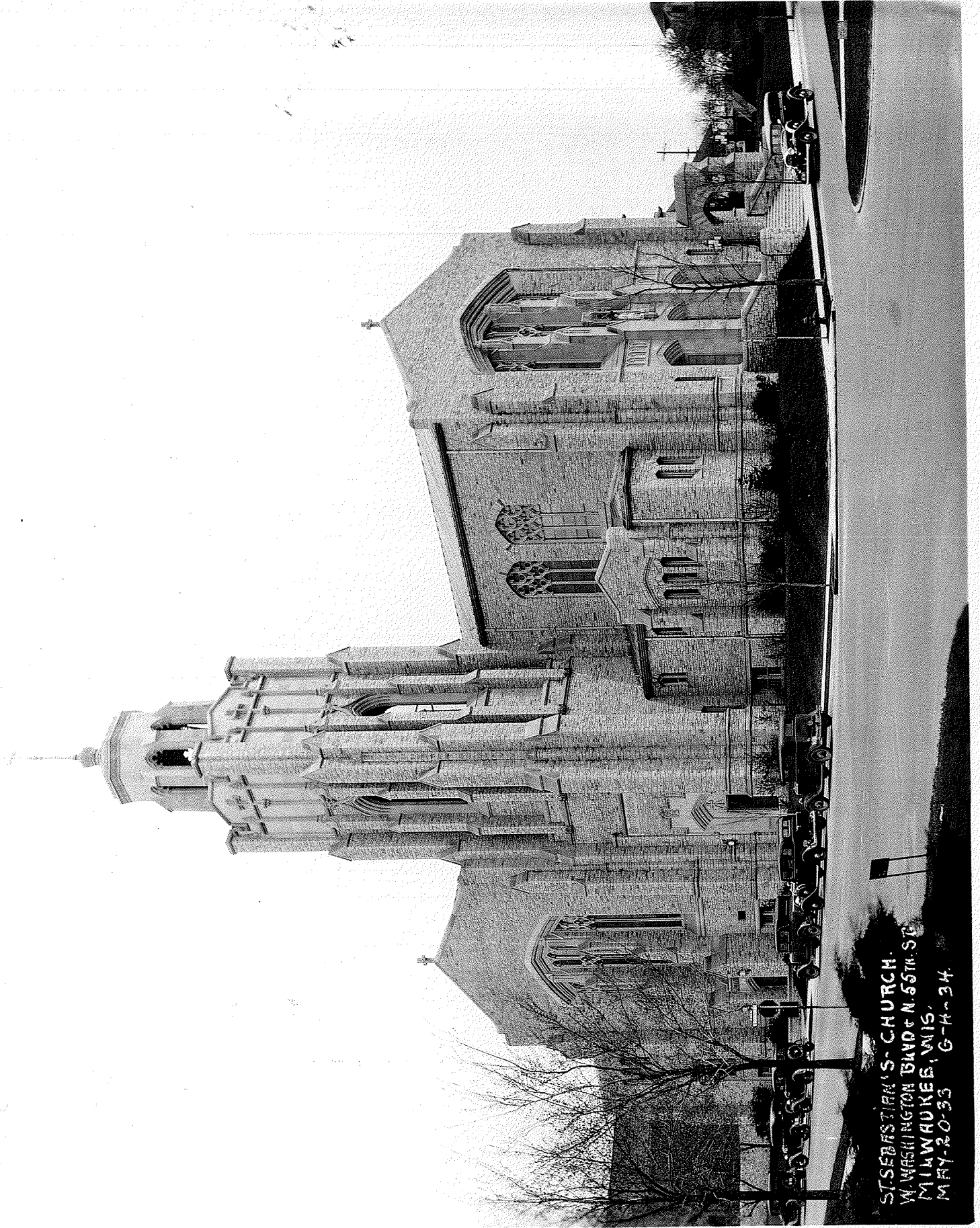
ST. SEBASTIAN'S CHURCH. W. WASHINGTON BLVD & N. 55TH ST. MILWAUKEE, WIS. MAY-20-35 G-H-34