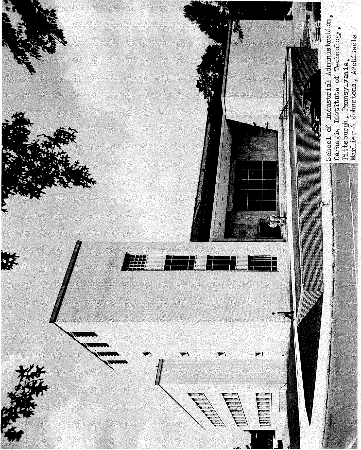
School of Industrial Administration, Carnegie Institute of Technology, Pittsburgh, Pennsylvania. Marlier & Johnstone, Architects