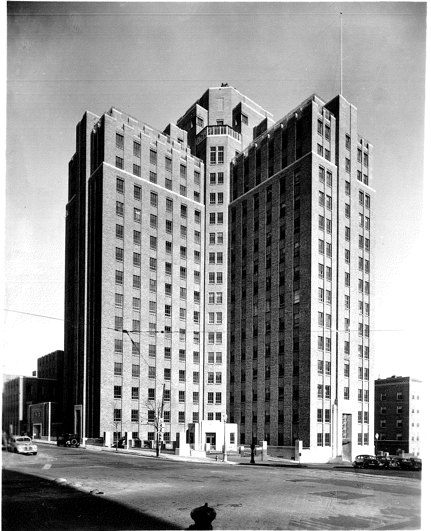
Hospital - Medical College of Virginia Richmond, Virginia

THE AMERICAN INSTITUTE OF ARCHITECTS ARCHIVES For information or study purposes only. Not to be recycled, quoted, or published without written permission from the AIA Archives, 1735 New York Ave. NW, Washington, DC 20006