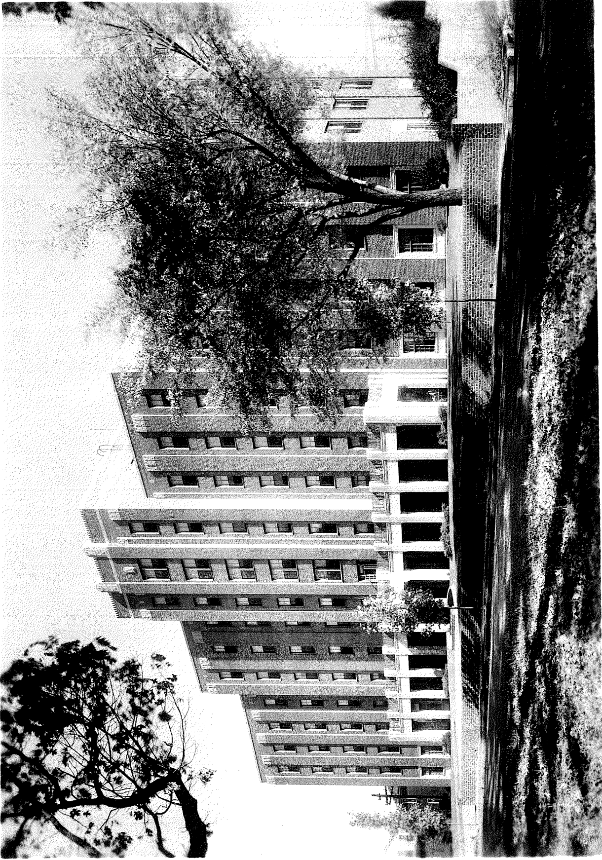
Home for Incurables Richmond, Virginia