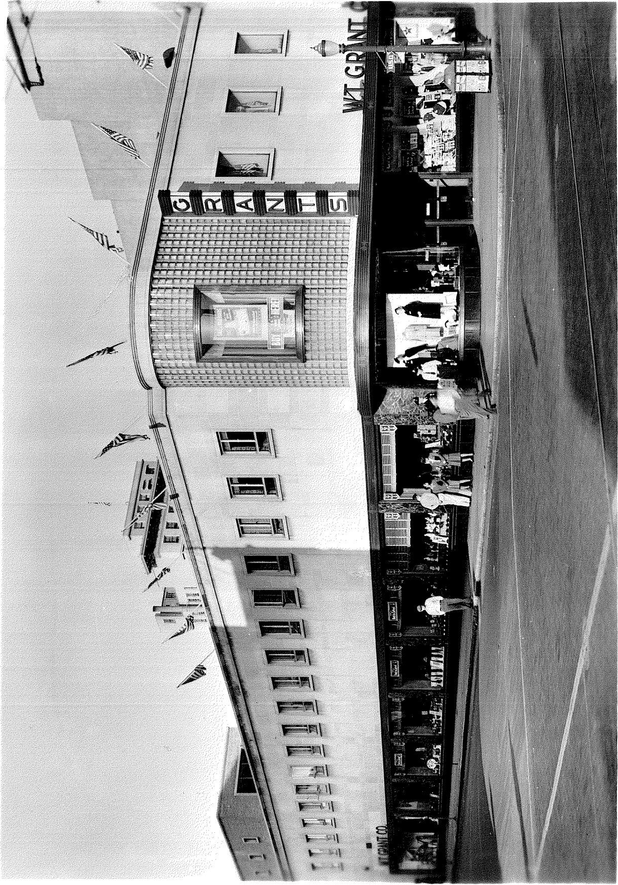
Store - W. T. Grant Company Richmond, Virginia