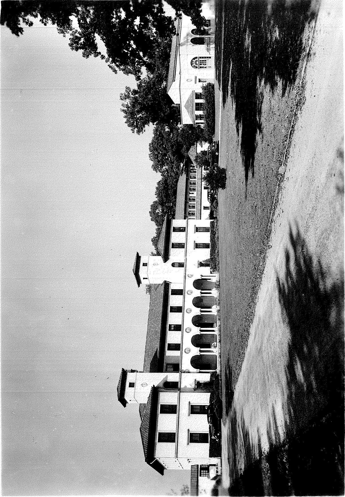
Crippled Children's Hospital Richmond, Virginia