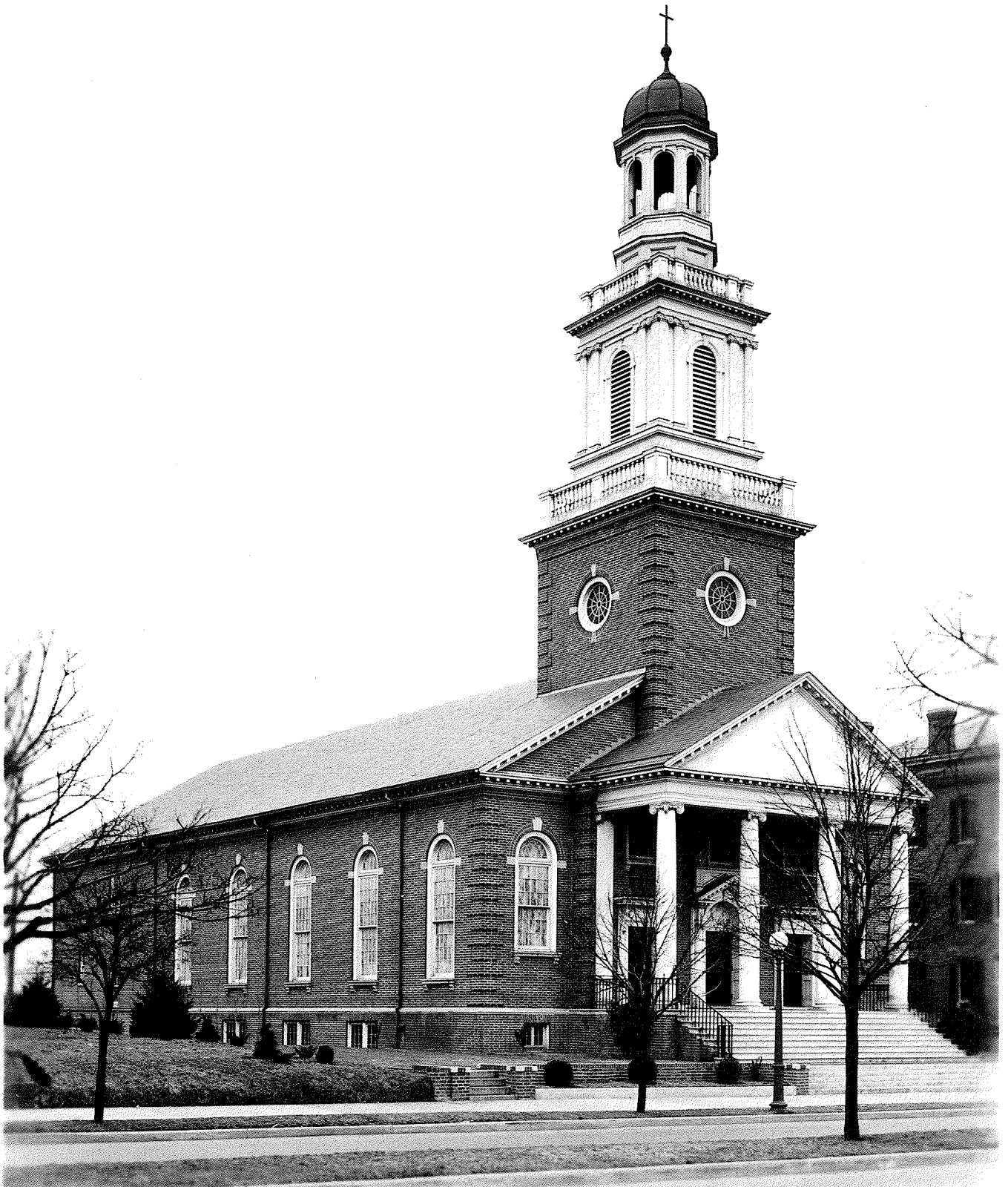
St. Mark's Episcopal Church Richmond, Virginia