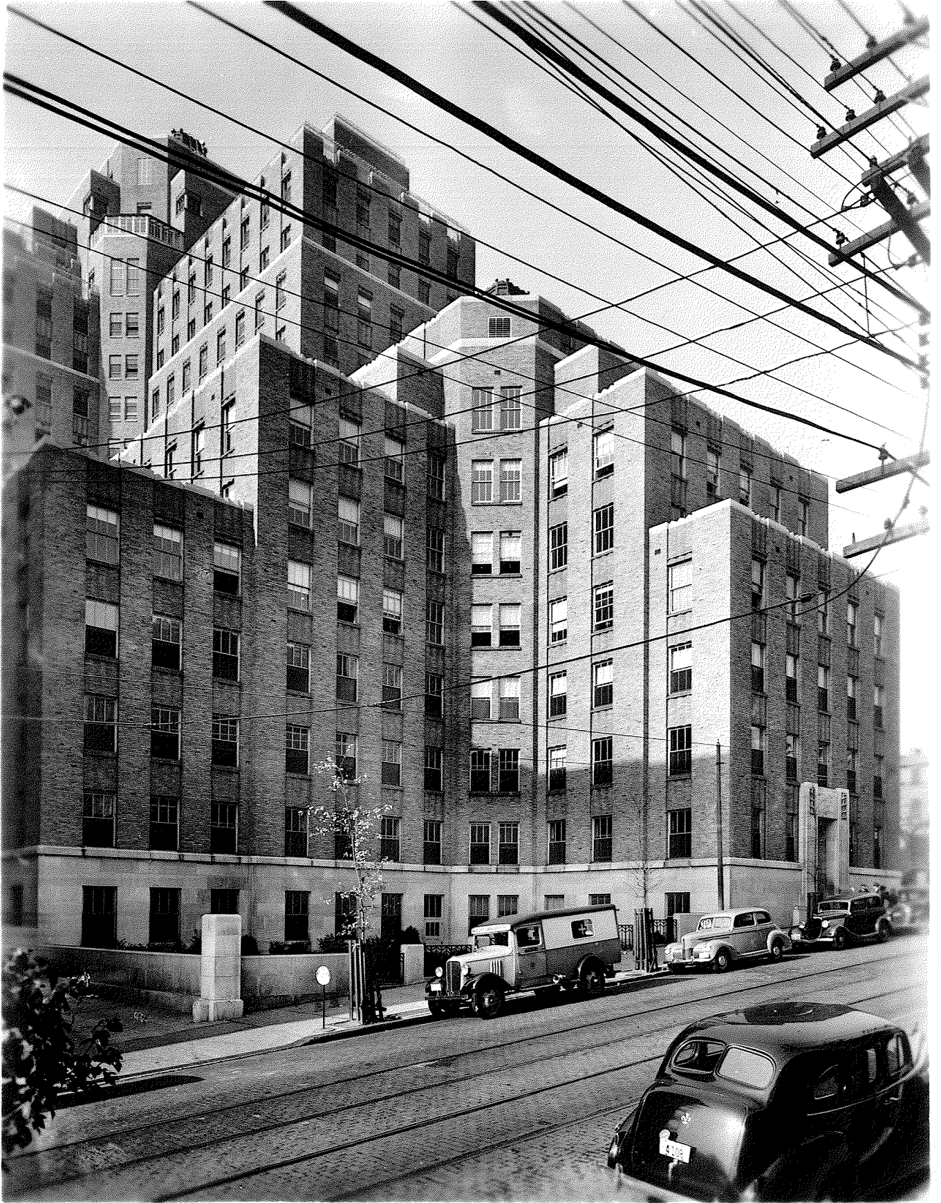
Clinic - Medical College of Virginia Richmond, Virginia

THE AMERICAN INSTITUTE OF ARCHITECTS ARCHIVES For information or study purposes only. Not to be recycled, quoted, or published without written permission from the AIA Archives, 1735 New York Ave. NW, Washington, DC 20006