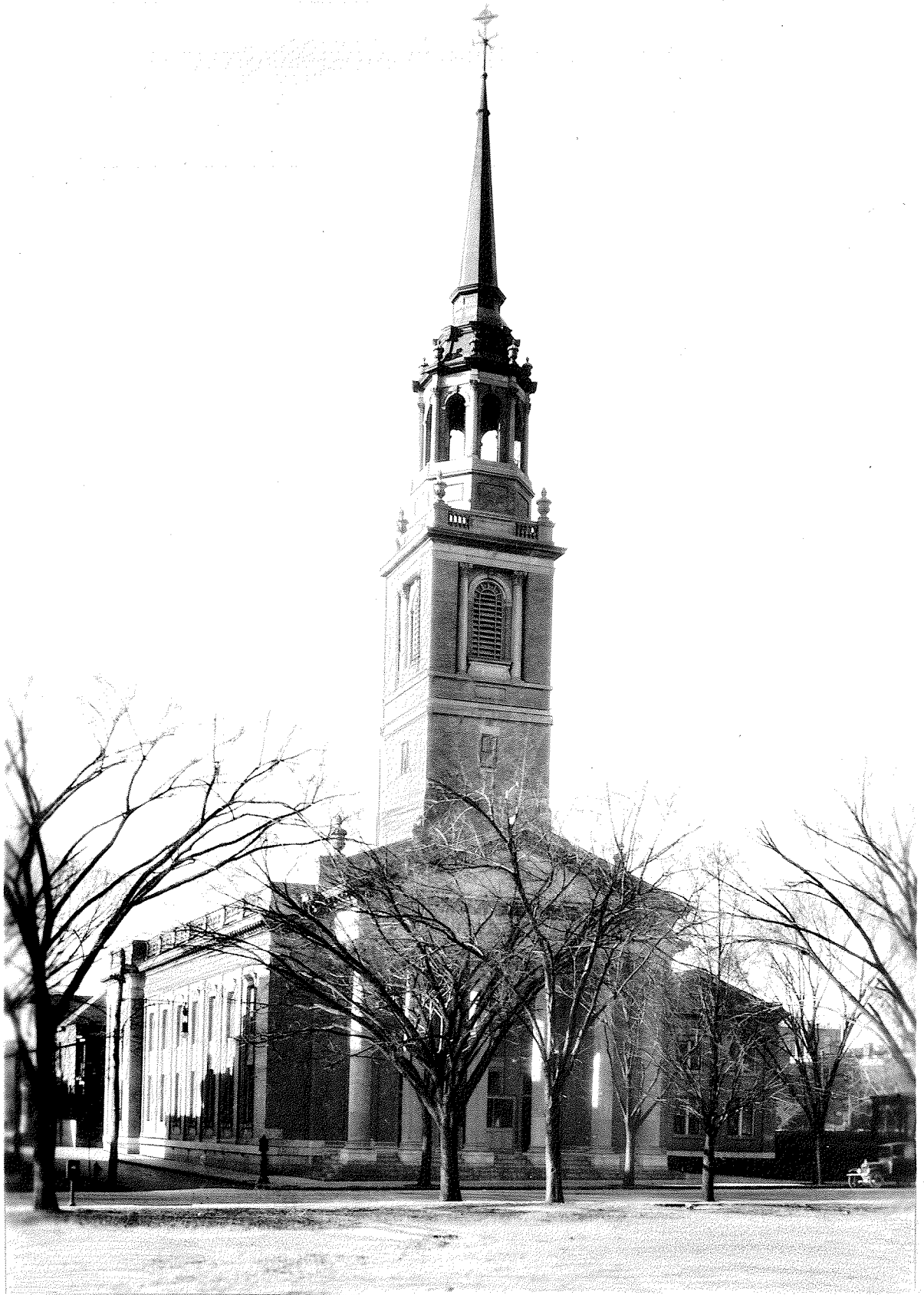
St. James Church Richmond, Virginia